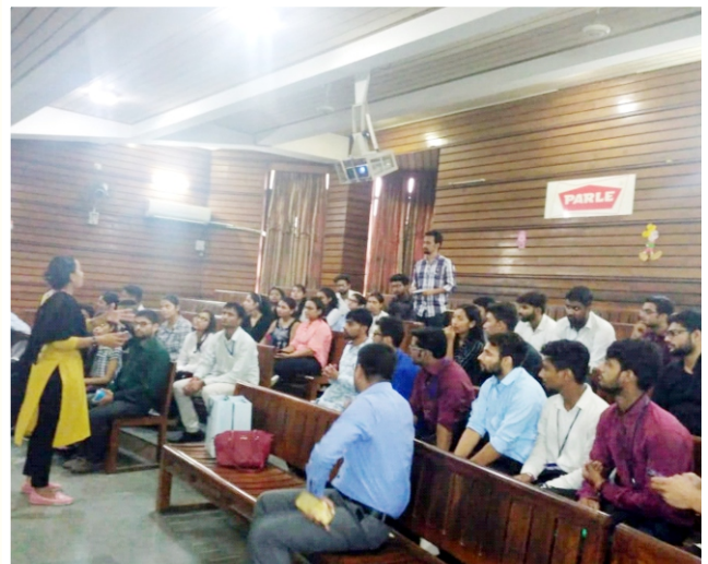
Parle G Plant