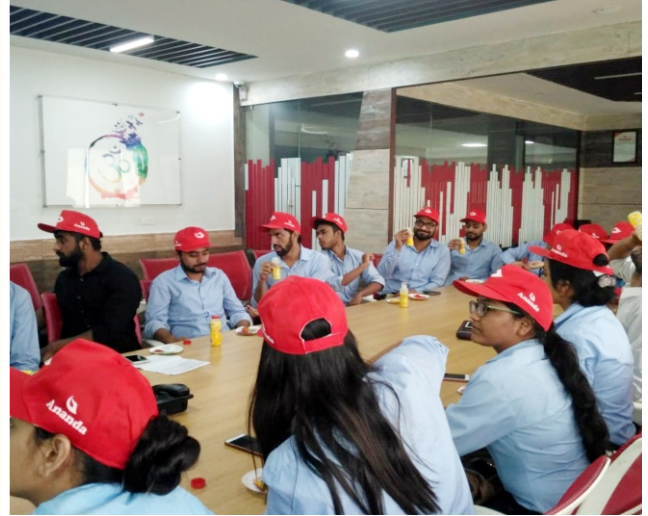
Ananda Dairy Plant